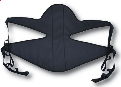
Lumbar strap with dorsal support Medium size - Réf. SR 370 3000 Large size - Réf. SR 370 4000